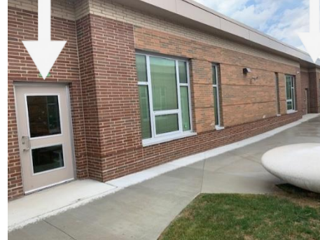
Step Three Sign student out at the classroom door.