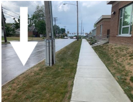
Step One Park along Larchmere