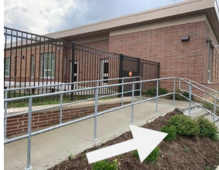
Step Two Walk up to the ramp to Gate 32